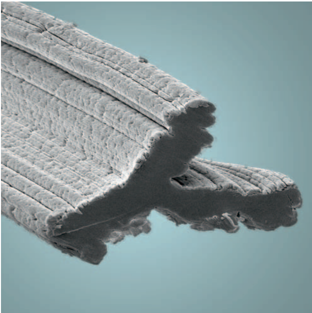
Cross section of Lenzing Viscostar® 3.3 dtex / 30 mm bright

Using Lenzing tampon fibers enables manufacturers to tailor the performance of their products according to the requirements of the market. This can be achieved by simply varying the blend ratio of Lenzing Viscose® and Lenzing Viscostar®.